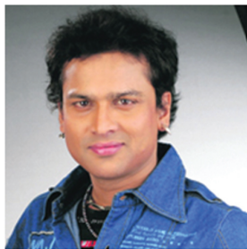
MR. ZUBEEN GARG